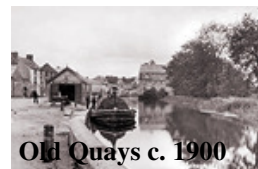
Old Quays c. 1900